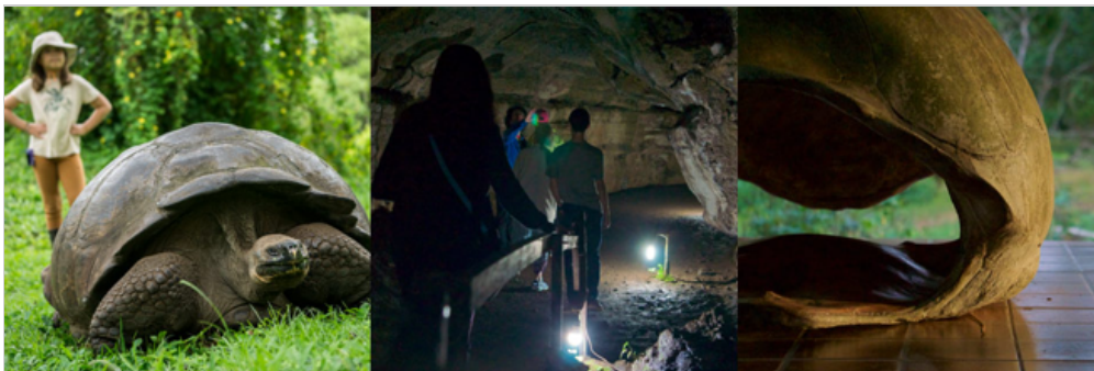
El Chato, Santa Cruz Island

El Chato reserve is divided into two areas: Caseta and Chato. The trail begins at Santa Rosa (13.7 miles / 22 km) from Puerto Ayora, with the Caseta route being the most challenging. The reserve allows visitors to observe giant tortoises in the wild during the dry season and is also a good place to spot short-eared owls, Darwin's finches, yellow warblers, Galapagos rails and paint-billed crakes.