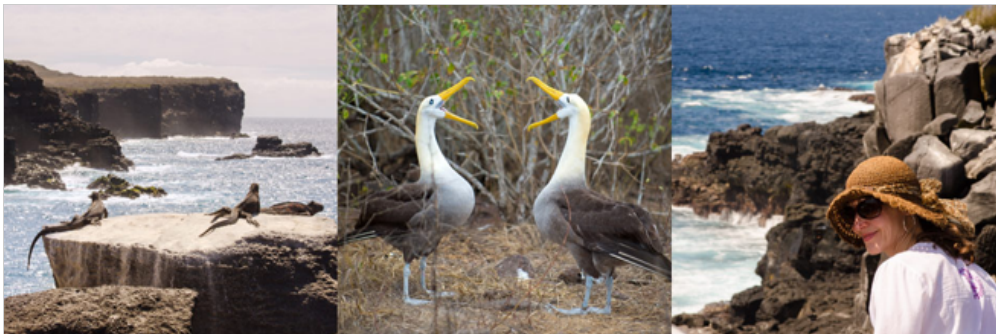
Suarez Point, Española Island

On the trail to Suarez Point you will have the chance to spot blue-footed boobies, albatrosses, and Nazca boobies. This island is the breeding site of nearly all of the world's 12,000 pairs of waved albatrosses. You will also visit a beautiful site on the ocean front where there is a cliff that the large albatrosses use as a launching pad! You will have the chance to see the famous blowhole that spurts sea water into the air. The landscape is great for photography.