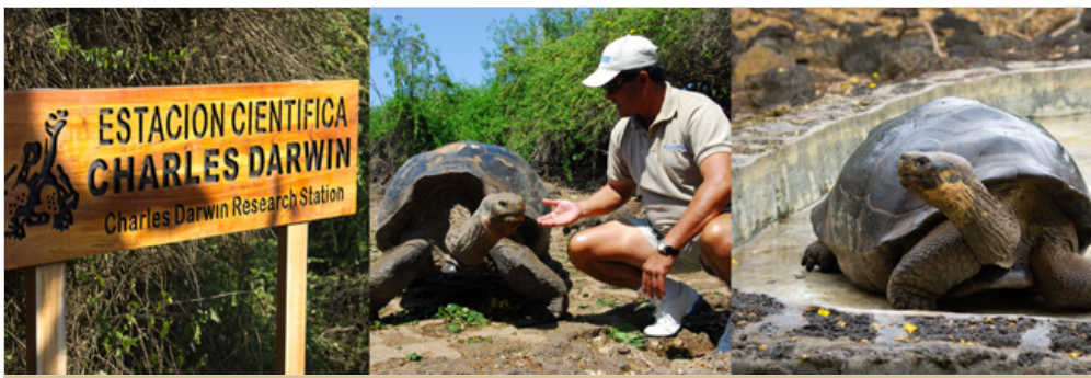
Fausto Llerena Breeding Center, Santa Cruz Island