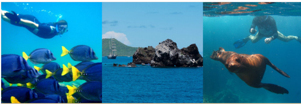
Devil's Crown, Floreana Island