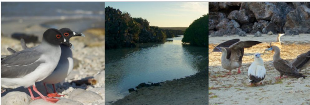
Darwin Bay, Genovesa Island

Visit the white-sand coral beach of Darwin Bay which includes a half mile trail (0,75km) that winds through mangroves filled with land birds. Nazca boobies, red-footed boobies, and swallow-tailed gulls, which can easily be spotted here. Further down the path we'll find tidal pools where sea lions swim playfully. At the end is a spectacular view of a cliff.