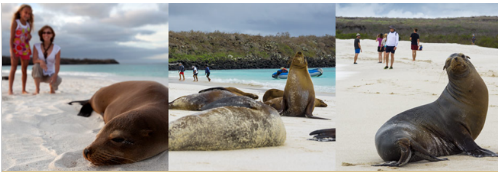
Gardner Bay, Gardner Islet & Osborn Islet, Española Island