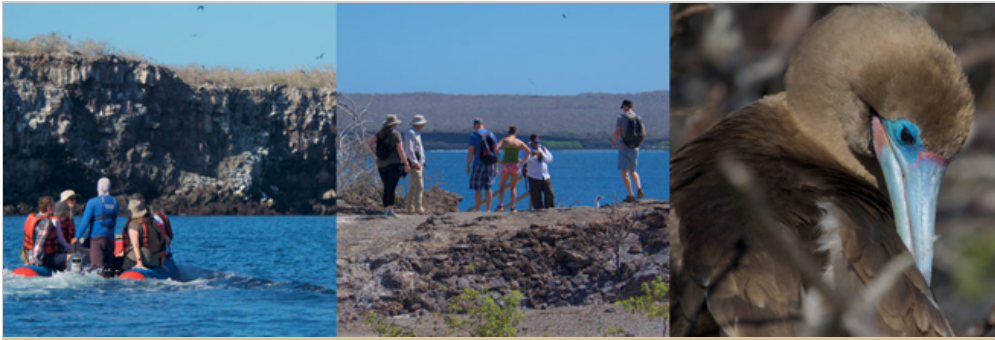
El Barranco, Genovesa Island

El Barranco, also known as Prince Phillip's Steps, is a steep, rocky path that leads up a high cliff rock face. A marvelous view can be appreciated from here. This site is also home to Palo Santo vegetation as well as red-footed boobies, short-eared owls, Galapagos storm petrels, and Galapagos doves.