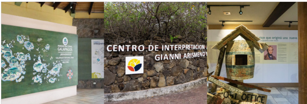
Gianni Arismendy Interpretation Center, San Cristobal Island

This site is part of an environment project. The tour of this center will explore the natural history of the islands including human interaction and conservation efforts. The Museum of Natural History explains the volcanic origin of the archipelago, ocean currents, climate, and the arrival of endemic species. The Human History exhibit chronologically describes significant events such as discovery and colonization of the islands.